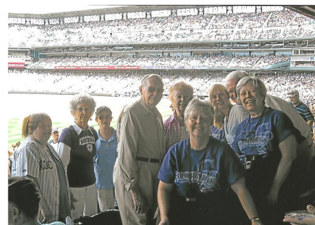
CTK at Colorado Rockies' Faith Day August 21, 2011